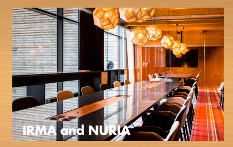
Two brand new boardrooms on the third floor with breathtaking views. Daylight.