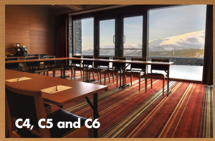
Amazing view over the mountains. C4 and C5 can be merged into one large room. Daylight.

Our largest room with capacity for 400 seated guests. Can be divided into three separate rooms. Daylight.