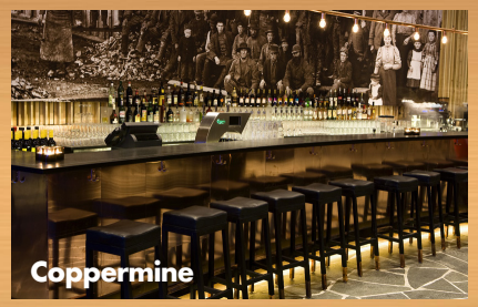
Suitable for conference, after ski, nightclub, exhibitions and banquets.

With 19000sqm and a unique lobby with a ceiling height of 23 meter, we are able to create unforgettable events.